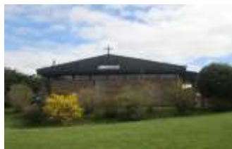
St Fergus 94 Glenogil Terrace FORFAR Angus DD8 1NG