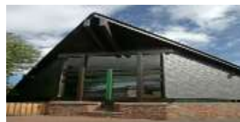
St Anthony's 3 St Mary's Close KIRRIEMUIR Angus DD8 4GW

Sacrament of Reconciliation in Forfar, or on request