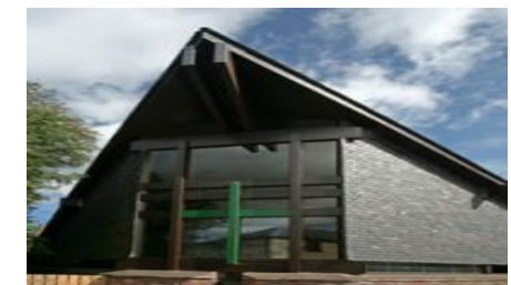
St Anthony's 3 St Mary's Close KIRRIEMUIR Angus DD8 4GW

Sacrament of Reconciliation in Forfar, or on request