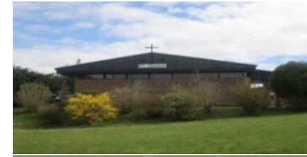
St Fergus 94 Glenogil Terrace FORFAR Angus DD8 1NG