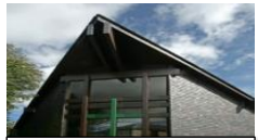
St Anthony's 3 St Mary's Close KIRRIEMUIR Angus DD8 4GW