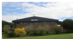
St Fergus 94 Glenogil Terrace FORFAR Angus DD8 1NG