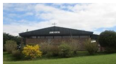
St Fergus 94 Glenogil Terrace FORFAR Angus DD8 1NG