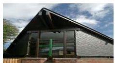
St Anthony's 3 St Mary's Close KIRRIEMUIR Angus DD8 4GW