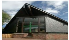
St Anthony's 3 St Mary's Close KIRRIEMUIR Angus DD8 4GW