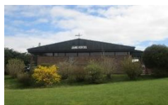
St Fergus 94 Glenogil Terrace FORFAR Angus DD8 1NG