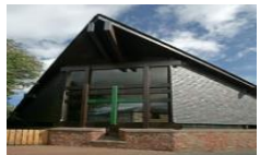
St Anthony's 3 St Mary's Close KIRRIEMUIR Angus DD8 4GW