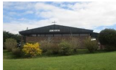
St Fergus 94 Glenogil Terrace FORFAR Angus DD8 1NG