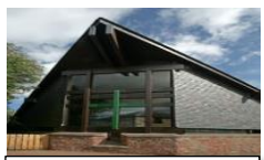
St Anthony's 3 St Mary's Close KIRRIEMUIR Angus DD8 4GW

Saturday 4.30pm – 5.30pm Sacrament of Reconciliation or on request *****