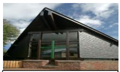
St Anthony's 3 St Mary's Close KIRRIEMUIR Angus DD8 4GW