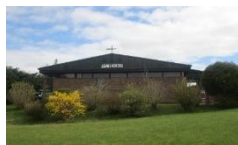
St Fergus 94 Glenogil Terrace FORFAR Angus DD8 1NG