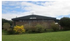
St Fergus 94 Glenogil Terrace FORFAR Angus DD8 1NG