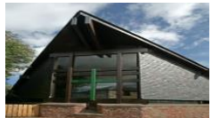
St Anthony's 3 St Mary's Close KIRRIEMUIR Angus DD8 4GW