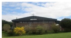
St Fergus 94 Glenogil Terrace FORFAR Angus DD8 1NG