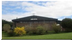
St Fergus 94 Glenogil Terrace FORFAR Angus DD8 1NG