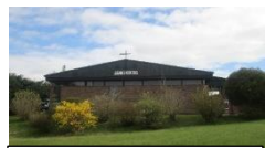
St Fergus 94 Glenogil Terrace FORFAR Angus DD8 1NG