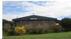
St Fergus 94 Glenogil Terrace FORFAR Angus DD8 1NG