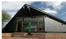
St Anthony's 3 St Mary's Close KIRRIEMUIR Angus DD8 4GW

Saturday 4.30pm – 5.30pm Sacrament of Reconciliation or on request